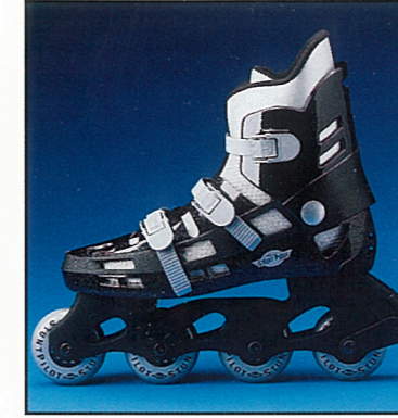
STUNT PILOT™ Advanced Level

For smooth skaters and speed demons, too. These bearings really fly! The wheels are high-rebound, shock-absorbing and big, (72mm, adult sizes). The brake is adjustable for added high-flying mileage.