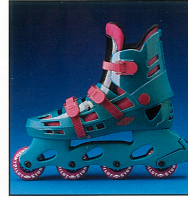
STUNT PILOT™ Intermediate to Advanced

Road Rocket™ skaters are on a roll, and three, quick-latch buckles give them all the support they need. Lightweight, cushioned style, plus upgraded bearings and sporty, printed wheels.