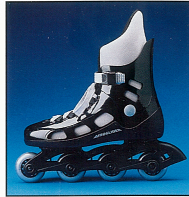
AERO GLIDER™ Entry to Intermediate Level

Beginners start here. Novice skaters love the looks ... and the brake ... on these skates. Sporty laces, easy-glide bearings, lightweight, air-vented boots and a cushioned liner make in-line skating a breeze.