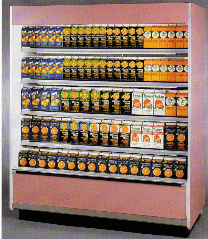
S SERIES 35

Barker listens . Barker believes in "customer-driven" design. We apply our manufacturing expertise to your marketing challenges. Features important to you are important to us. That's why visibility is high, accessibility is easy, defrost time is limited and air flow is controlled. Customizing is fast and flexible. Barker builds versatility into every case.