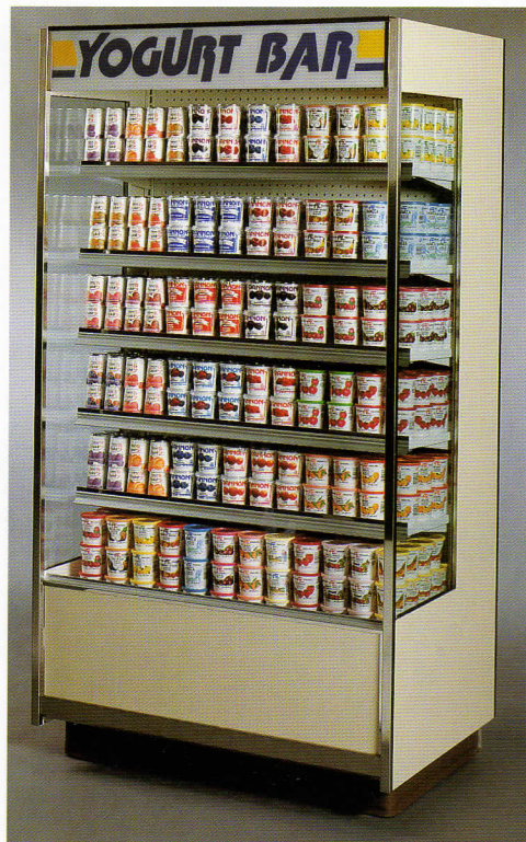
S SERIES 30