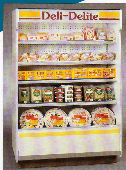
S SERIES 30