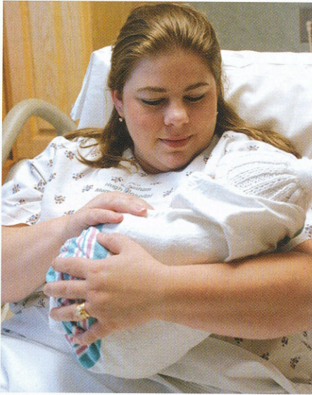
The Birthplace, a unique birthing center, is just one of many patient-centered services.

community ambassadors to bring health education and outreach closer to home. The hospital's foundation raises funds to provide much-needed services and equipment so that the innovation and improvements can keep on growing well into the future.